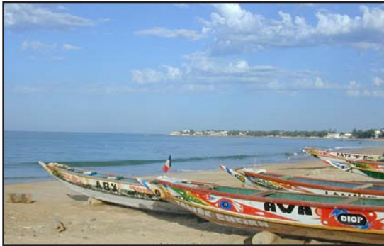
EcoYoff is part of a fishing village on the Atlantic coast.